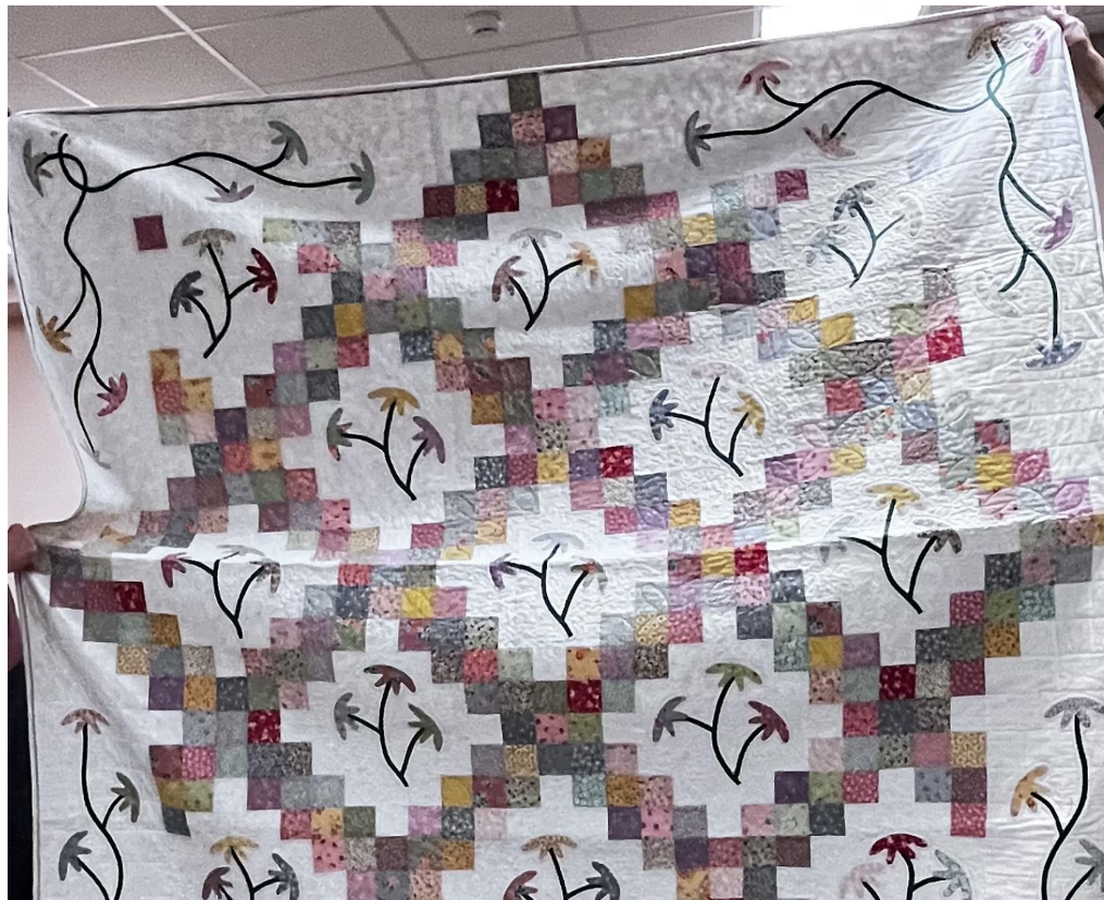
Right: Grannies Daisy Chain from Issue 105 of the Down Under magazine from 2007. Brenda expanded the pattern from 2.5" blocks to 3" blocks. She then had to redraft the daisies. This quilt will be in the Sagebrush Quilt Show 2024.