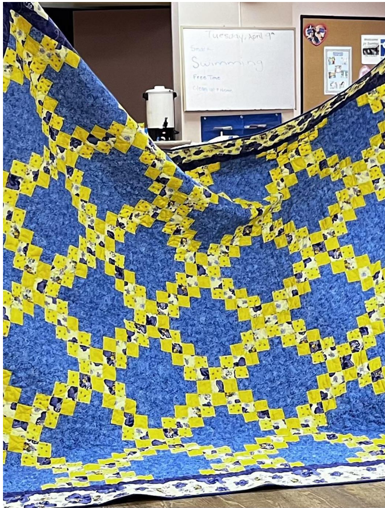
Quilts for Katherine's Place