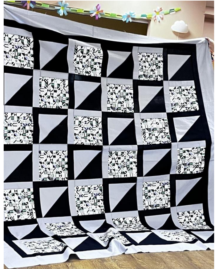
Quilts for Katherine's Place